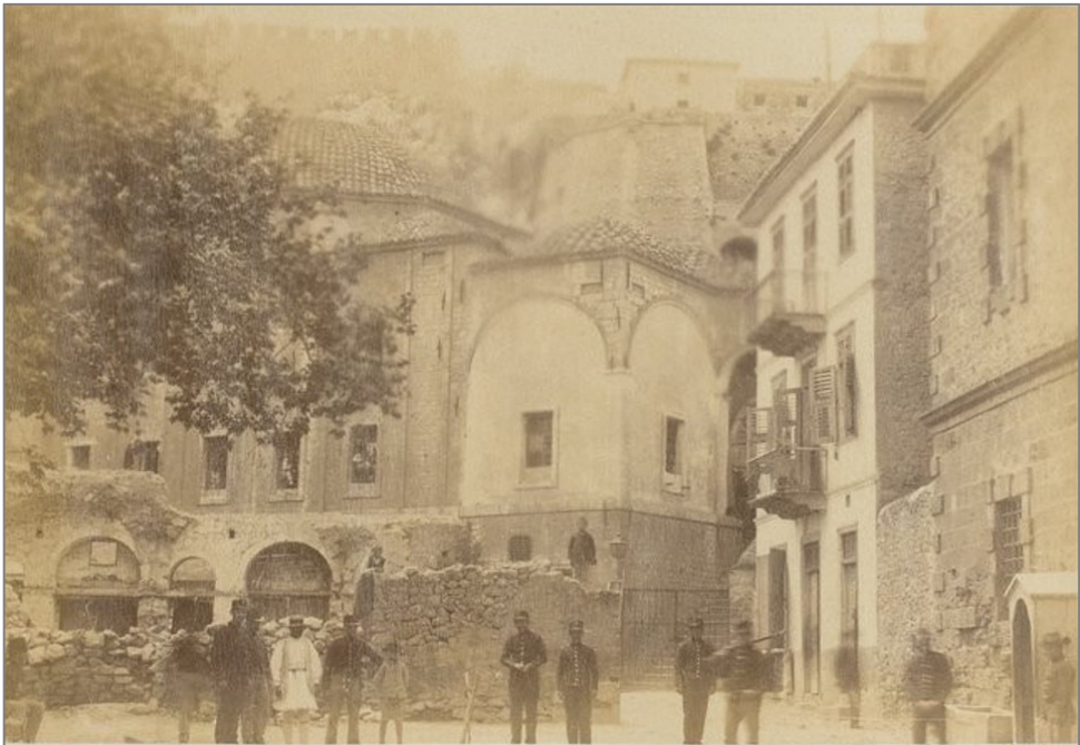
Fig. 2: The prison at Vouleftikon: the prisoners are huddled in front of the open windows, looking at the busy central Syntagma Square. « Nauplie. Ancienne église aujourd’hui prison ». Photographer and donator: Hubert Vaffier, before 1892.

The outcome was two distinct performances: a promenade performance in the old prisons of Nafplion, and a devised play performed by students and prisoners at the Agricultural Prison of Tiryns. Both projects were presented in the Prague Quadrennial of Performance Design and Space 2023 as part of the Greek student exhibition, under the title Nafplion Blues: Prison Stories . In the present article, the authors share their experience as the workshop instructors and focus on the use of the prison – in the present and in the past – as performance space. More specifically, the authors aim to underpin how prisons oscillate between public and private space, and thus demonstrate how this oscillation shaped the qualities of each performance.