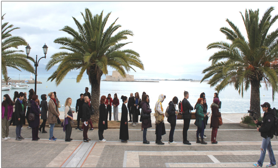
Fig. 8: The pilgrimage procession starting in the port of Nafplion. Listen-Watch-Be Silent , 21 January, 2023. Workshop instructors: Athena Stourna and Pablo Berzal Cruz.

detainees. The performance began as lightly as a tourist visit that soon turned into a nightmarish procession, when the spectators suddenly listened the motto “Listen-Watch-Be Silent” and were forced to form a line of what could be a group of prisoners of the past. From then on, they followed the same steps of the political prisoners who would arrive at the port and would be taken up to the Acronafplia prison to begin their sentence (Fig. 8).