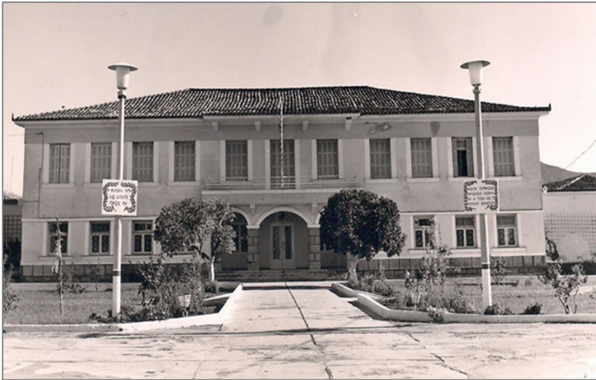
Fig. 5: Historical landmarks used in continuity until the present day: the neoclassical building that was initially the governor Ioannis Kapodistrias' summer residency (ca. 1830) and later used as the headquarters of the first Agricultural School of Greece, now houses the Administration office of the Agricultural Prison of Tiryns.

arrived to take office, in order to feed the starving population. Some of the first cultivations of potatoes in Greece took place at the Agricultural School, and continue to be performed by the farmer-prisoners nowadays; therefore, agricultural work has been ongoing at Tiryns for almost two centuries.