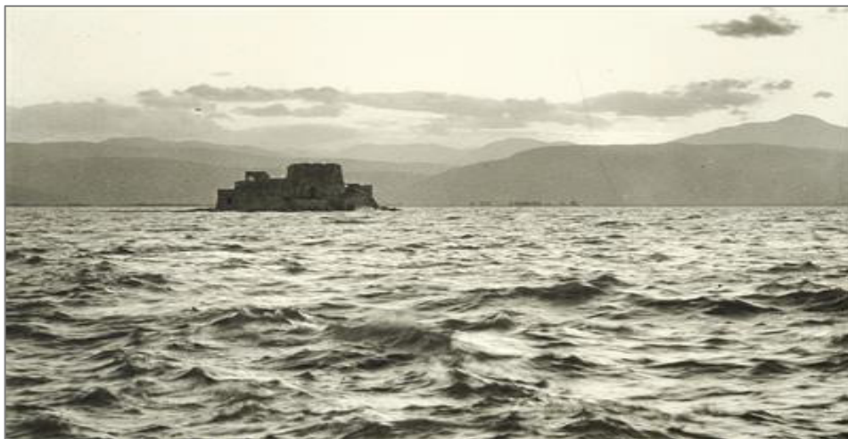
Fig. 3: The Bourtzi islet. Nafplio, Bourtzi Castle. Photographic copy from a glass plate of Fred Boissonnas, c. 1903-1923, Museum of Photography in Thessaloniki. Nafplio, Bourtzi Castle. Photographic copy from a glass plate of Fred Boissonnas, c. 1903-1923. The glass plate is at the Museum of Photography in Thessaloniki. ( nhmuseum.gr)