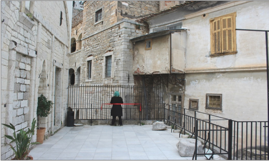
Fig. 10: Percy Koritsidou performing at Vouleftikon. Listen-Watch-Be Silent , 21 January, 2023. Workshop instructors: Athena Stourna and Pablo Berzal Cruz.