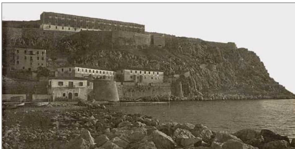
Fig. 4: The old Venetian building (now demolished) at the top of hill, housed the political prison of Acronafplia. Unknown photographer and date taken. Source: Αργολική Αρχαιακή Βιβλιοθήκη Ιστορίας και Πολιτισμού (The Argolikos Archival Library of History and Culture). Οι φυλακές της Ακροναυπλίας. | ΑΡΓΟΛΙΚΗ ΑΡΧΕΙΑΚΗ ΒΙΒΛΙΟΘΗΚΗ ΙΣΤΟΡΙΑΣ ΚΑΙ ΠΟΛΙΤΙΣΜΟΥ ( argolikivivliothiki.gr )