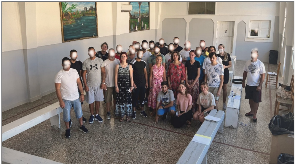
Fig. 6: The Agricultural Prison of Tiryns. Inmates, students, the workshop instructors and the prison’s director at the end of the performance.

Abandoning the theatre stage, we created our own theatre space, a “place” that we would all create together at the beginning of every session. By moving the wooden benches from the walls to the centre of the room we formed a – not at all strict – square shape (Fig. 6). Everything that happened – storytelling, singing, movement, games – took place within this space, created by the participants themselves. This collaborative spatial arrangement was crucial in empowering the group, cultivating trust, fostering cooperation for a common purpose and, most importantly, creating a sense of community – one that differed from the prison community, because it included students in its composition. In this direction, it is indicative to say that, at the beginning, inmates and students chose to sit on separate benches, due to an initial mutual reluctance between the two groups; however, this norm was gradually abandoned.